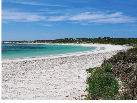
DAY 11: Friday 11 April 2025 The Pinnacles, WA

Today we travel to Nambung National Park to see the Pinnacles Desert that contains thousands of limestone pillars. The pillars are the weathered and eroded fragments of limestone beds composed of deposited marine organisms such as coral and molluscs. Some of the tallest pinnacles reach heights of up to 3.5m above the yellow sand base. We will enjoy a full day of painting in Nambung National Park. This evening we have an included dinner.